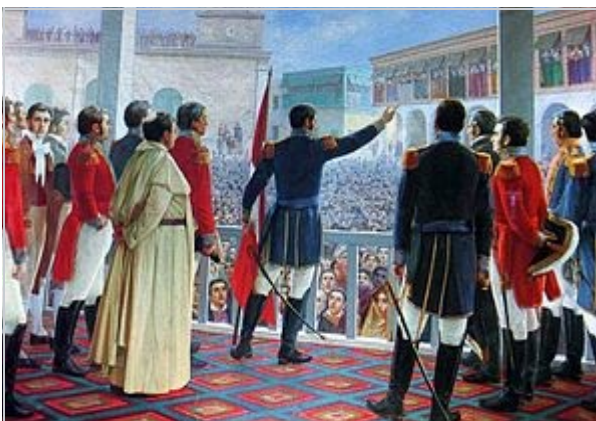
Proclamation of Independence